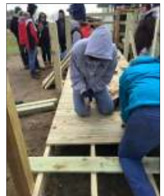
SFds youth hard at work